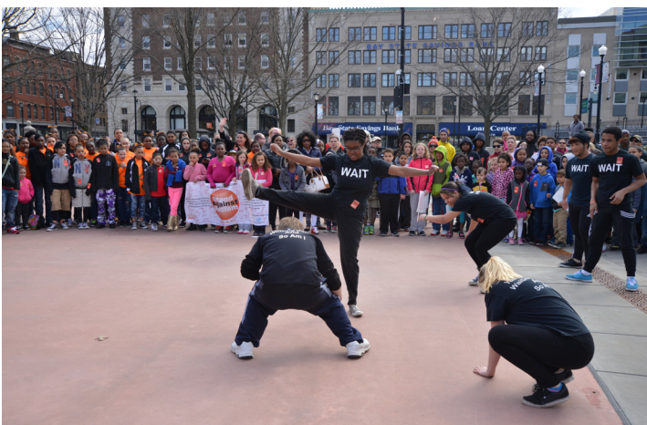
A crowd of all ages gathered in solidarity watch a youth performance at the Stand Against Racism.