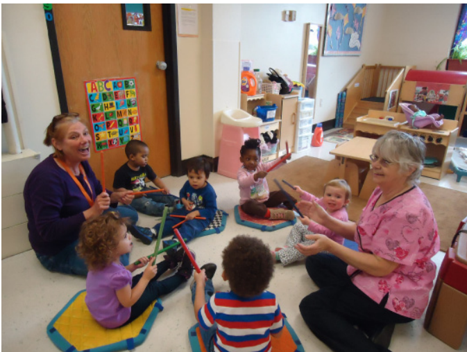
Early Education staff doing musical play with a group of children.