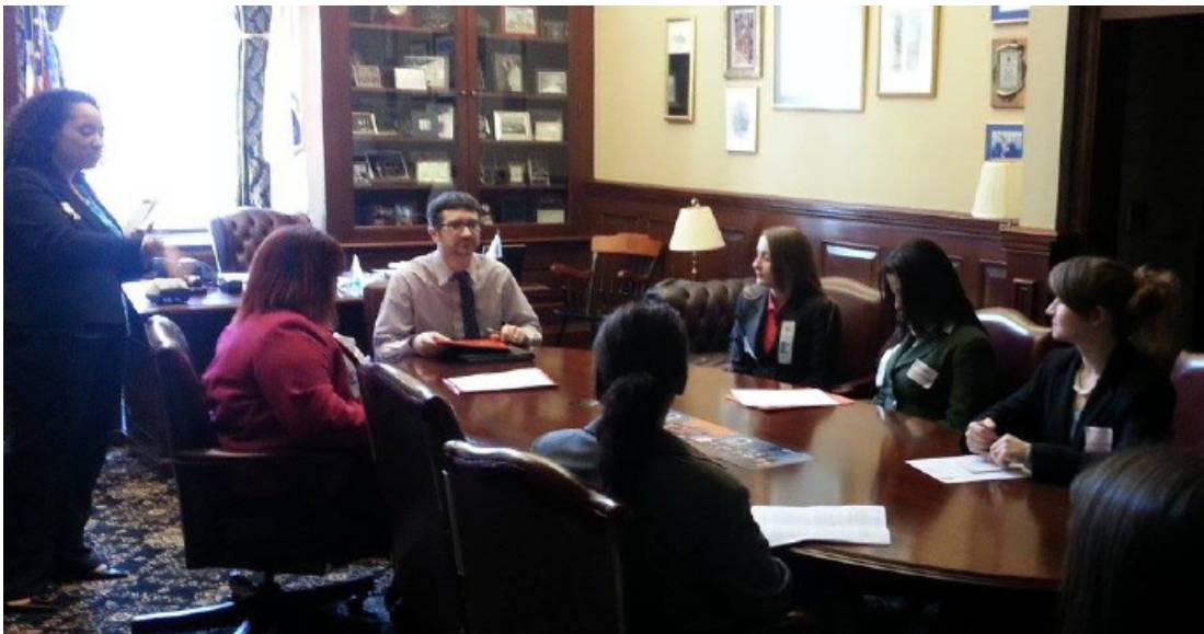
Young Parents Program participants joining Teen Parent Lobby Day at the State House.