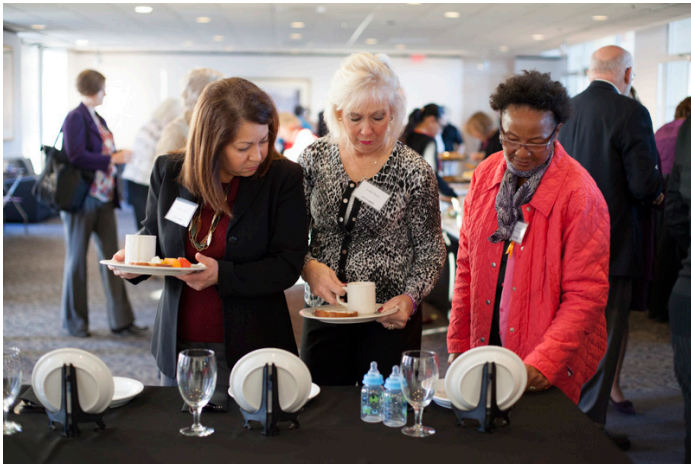
Reflection at the Empty Place at the Table display during the Annual Daybreak Breakfast.