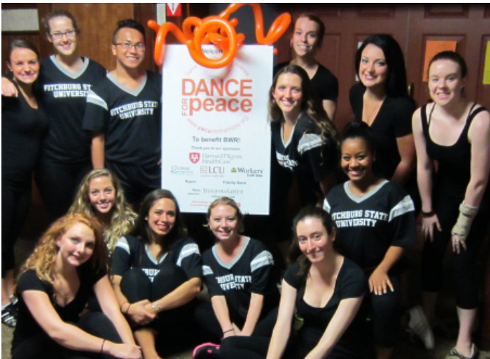
Members of the Fitchburg State University Dance Team attending the Annual Dance for Peace.