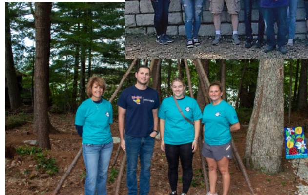
Thank you to Liberty Mutual Insurance, National Grid, and UMass Chan Medical School volunteers for help with Summer Camp prep and clean up!