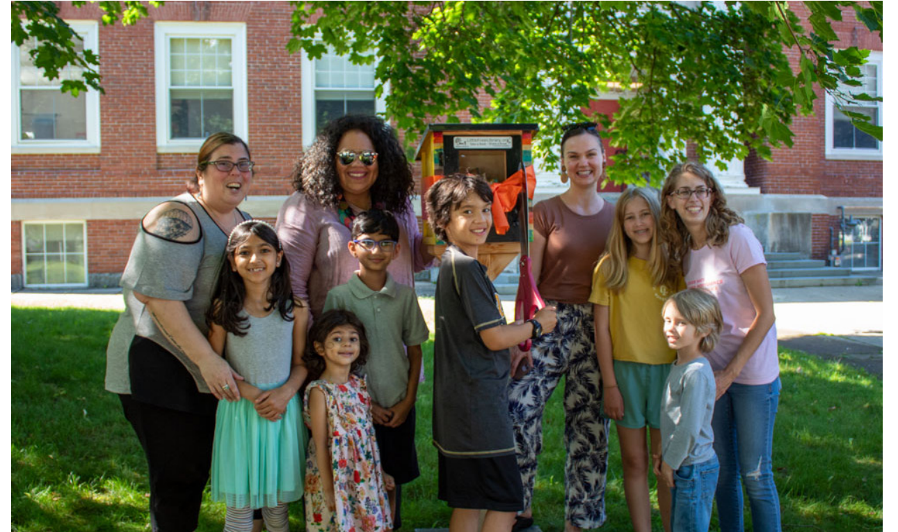
Ribbon-cutting ceremony to celebrate the opening of a Little Free Library at our Westborough Early Learning Center.