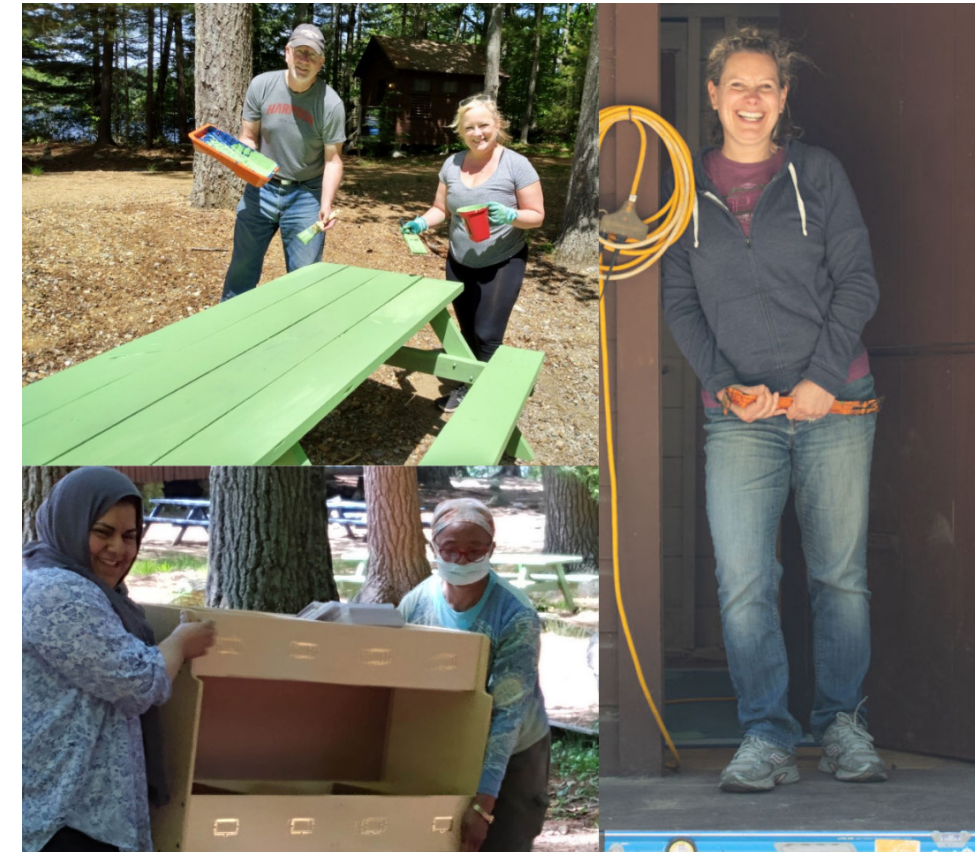
Thank you to Board members and Corporators for volunteering to help get us ready for summer camp!