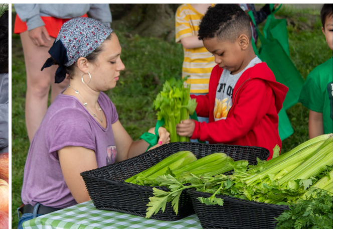
Thank you Regional Environmental Council (REC) for teaching our pre-schoolers about healthy food!